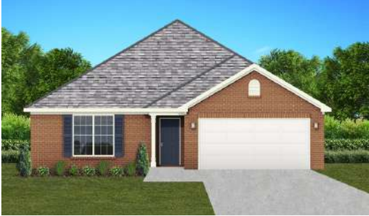
The Windsor $240,900