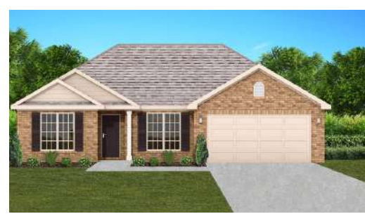
The Savannah $254,900