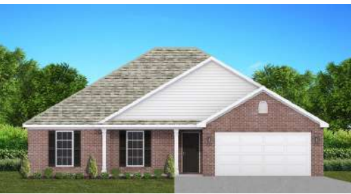
The Sawgrass $255,500