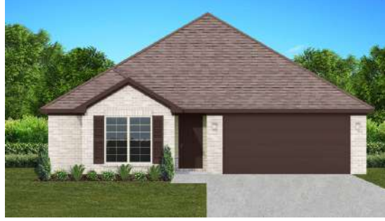
The Aspen $245,900