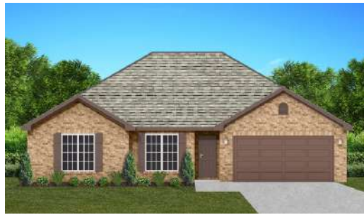
The Palmetto $250,900