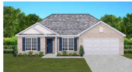
The Magnolia $257,300