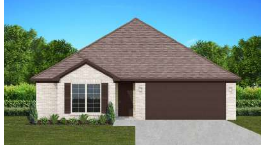
The Aspen $254,900