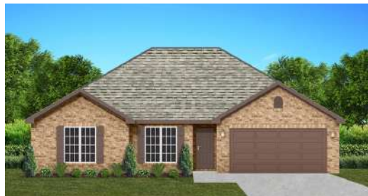
The Palmetto $259,900