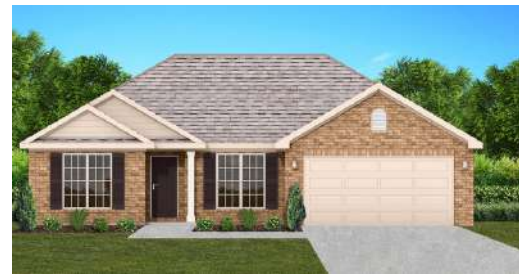
The Savannah $263,900