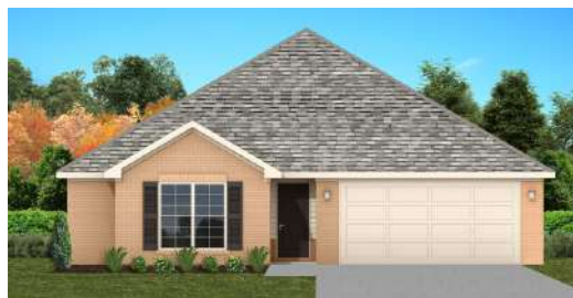
The Birch $265,500