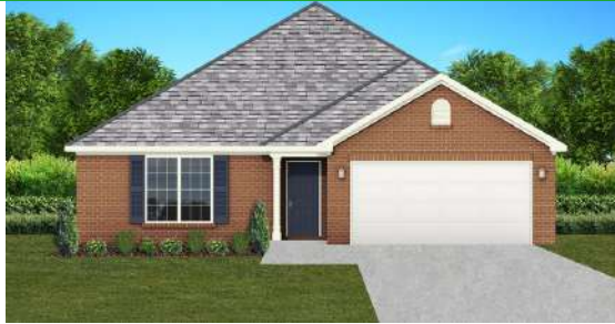
The Windsor $248,900