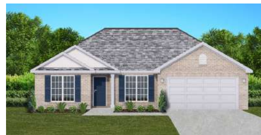
The Magnolia $266,300