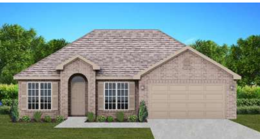
The Willow $257,300