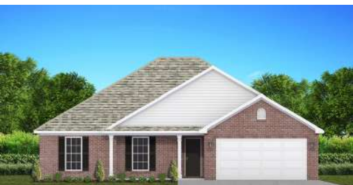
The Sawgrass $264,500