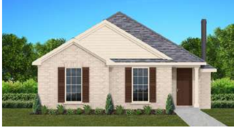
The Lilac $219,900