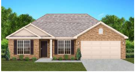
The Savannah $257,900