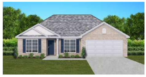
The Magnolia $260,300