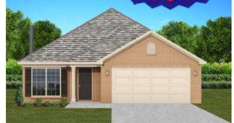
The Lily $231,900