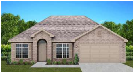
The Willow $253,300