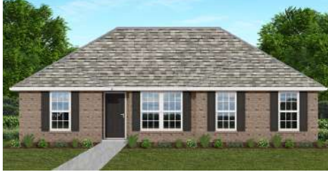
The Charlotte $228,500