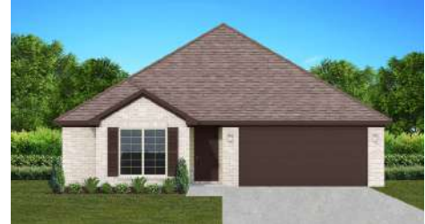
The Aspen $249,900