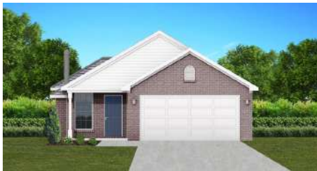
The Cambridge $236,900