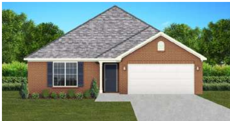
The Windsor $244,900