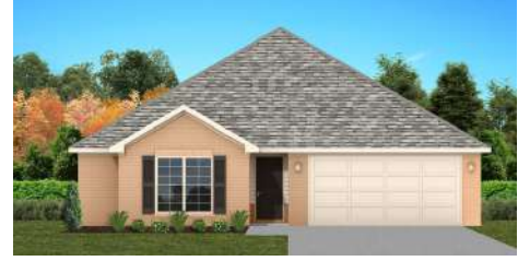
The Birch $259,500