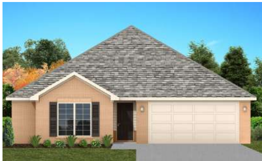
The Birch $244,500