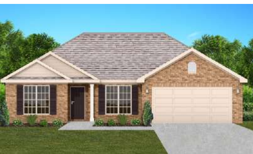
The Savannah $242,900