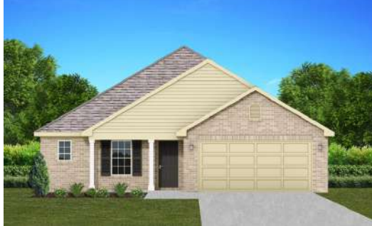
The Azalea $225,900