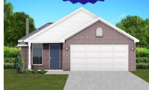
The Cambridge $226,400