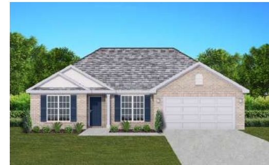
The Magnolia $246,300