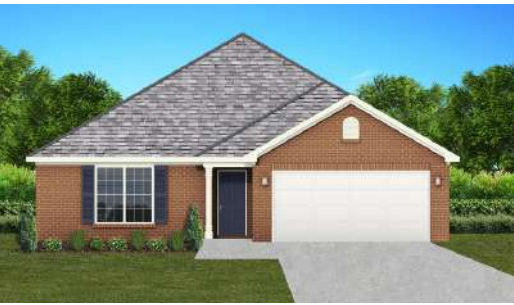
The Windsor $229,900