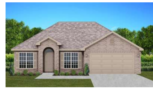
The Willow $237,300