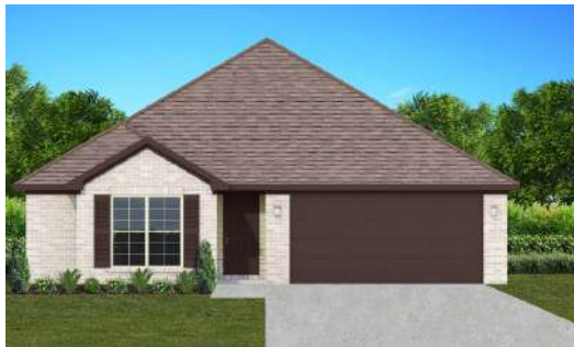
The Aspen $234,900