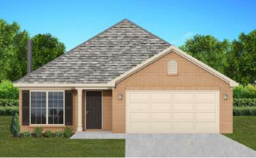
The Lily $220,900